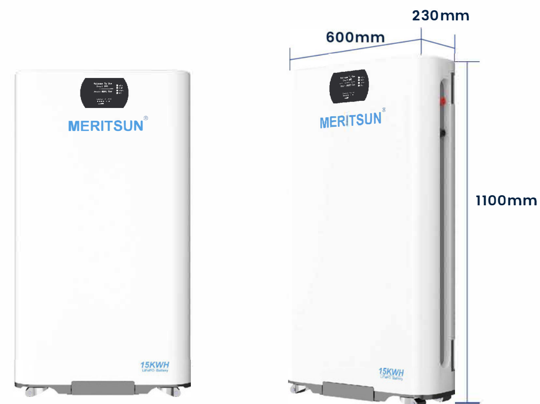
LFP48V/51.2V 300AH 15kwh MeritSun Powerwall