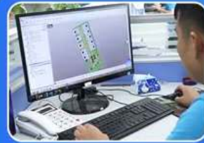
patent technology and Professional Independent R & D